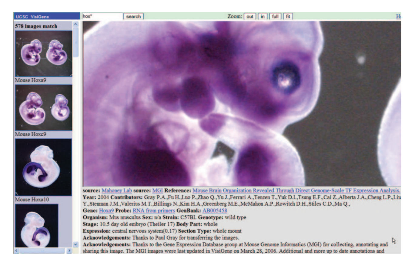
Figure 1. Screenshot of VisiGene display for mouse Hoxa9 gene.

VisiGene provides a series of thumbnail images in a panel to the left of the main viewing area and fully annotated full-resolution images in the main viewer area to the right (Figure 1). These are high-resolution images viewable in a